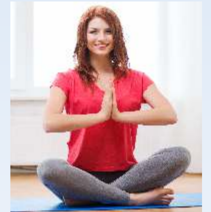
Yoga / Meditation