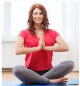
Yoga / Meditation